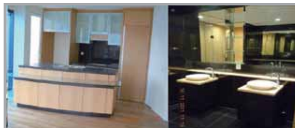
Unit Type B1 – Typical Elevation View of Vanity Top & Mirror