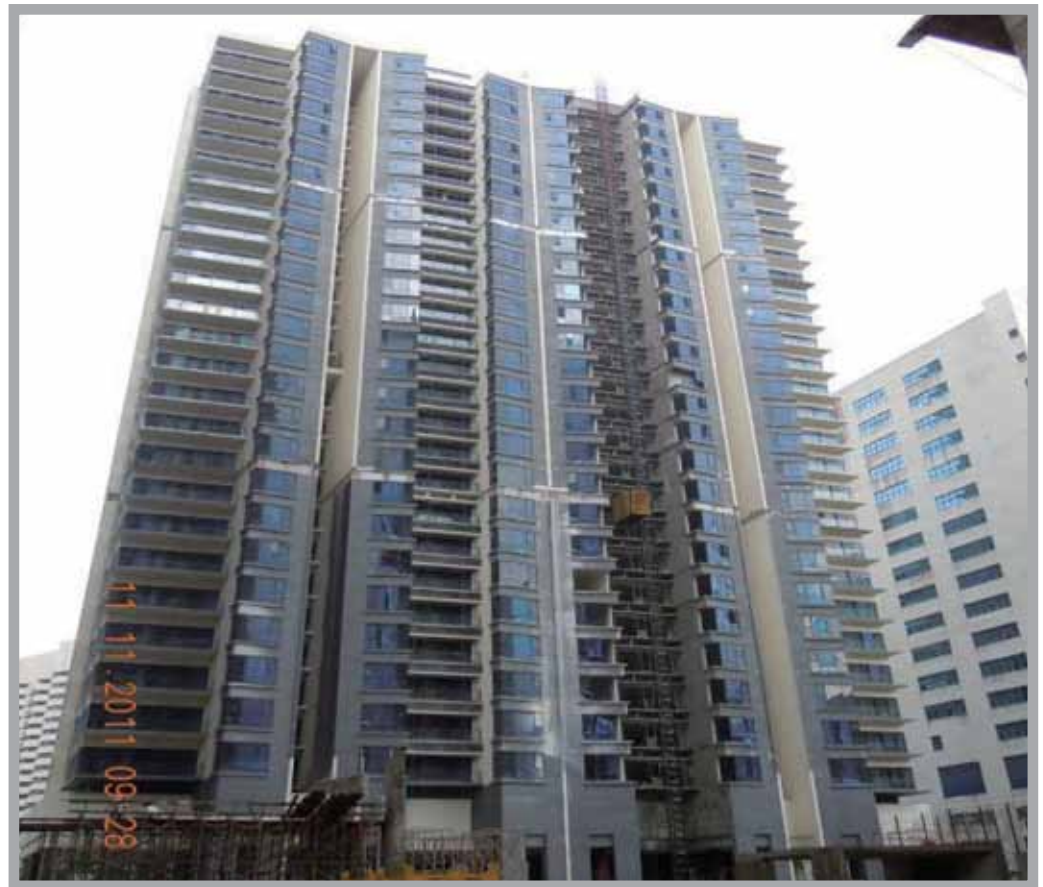
Elevation View of Tower B From Central Park

Please continue to pray for the Lord's guidance on this project.