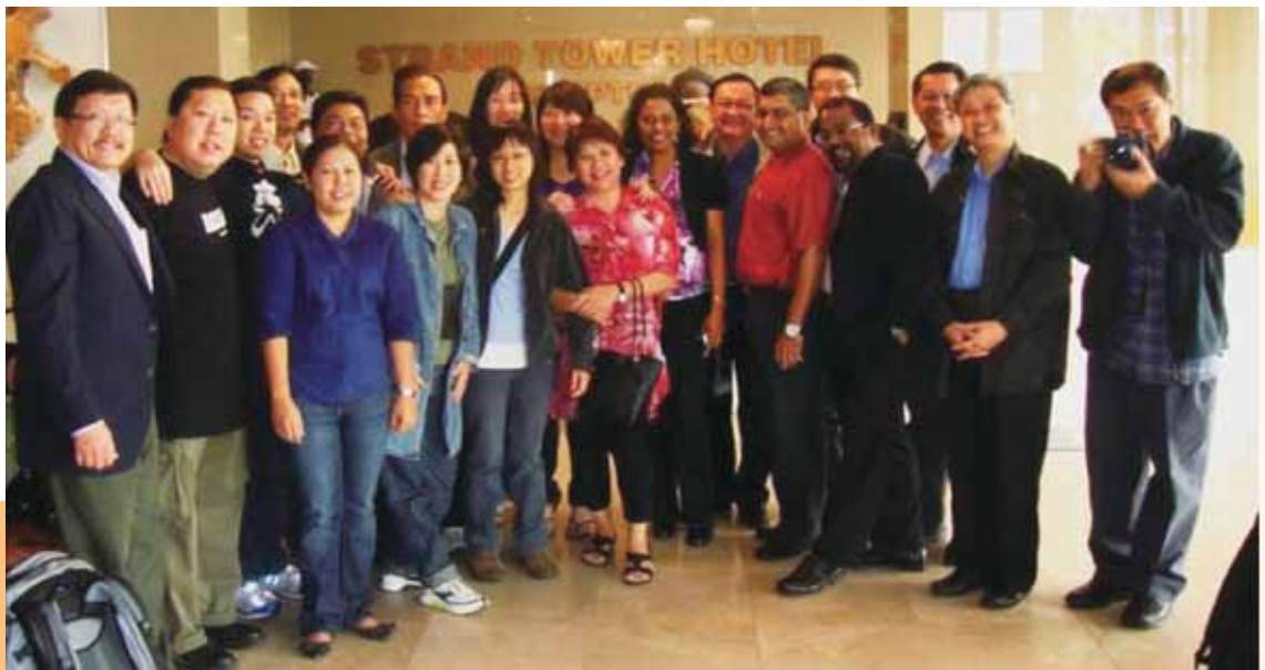
The Malaysian delegation