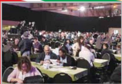
Lausanne Conference – My experience • Page 7