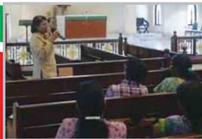
UCACW Tamil Women Organise Get-together • Page 10