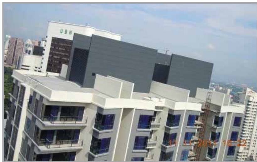
Aerial View of Tower B