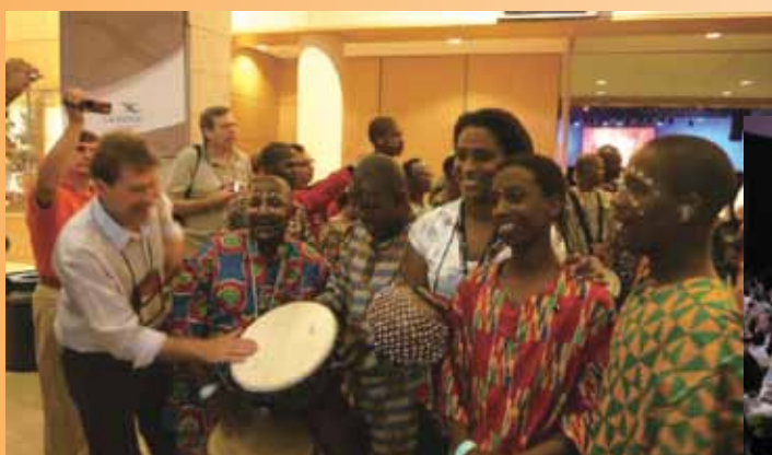
A cultural presentation