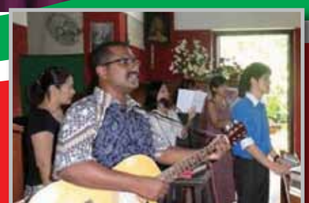
Mission from JB to Yangon • Page 14-15